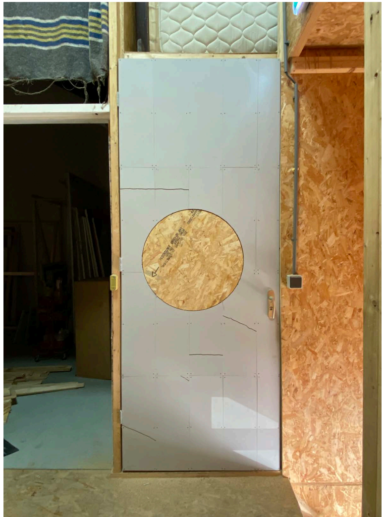
Untitled (Turned carpet), Untitled (Swaped wall) - 2024 - Found carpet, studio walls, traces