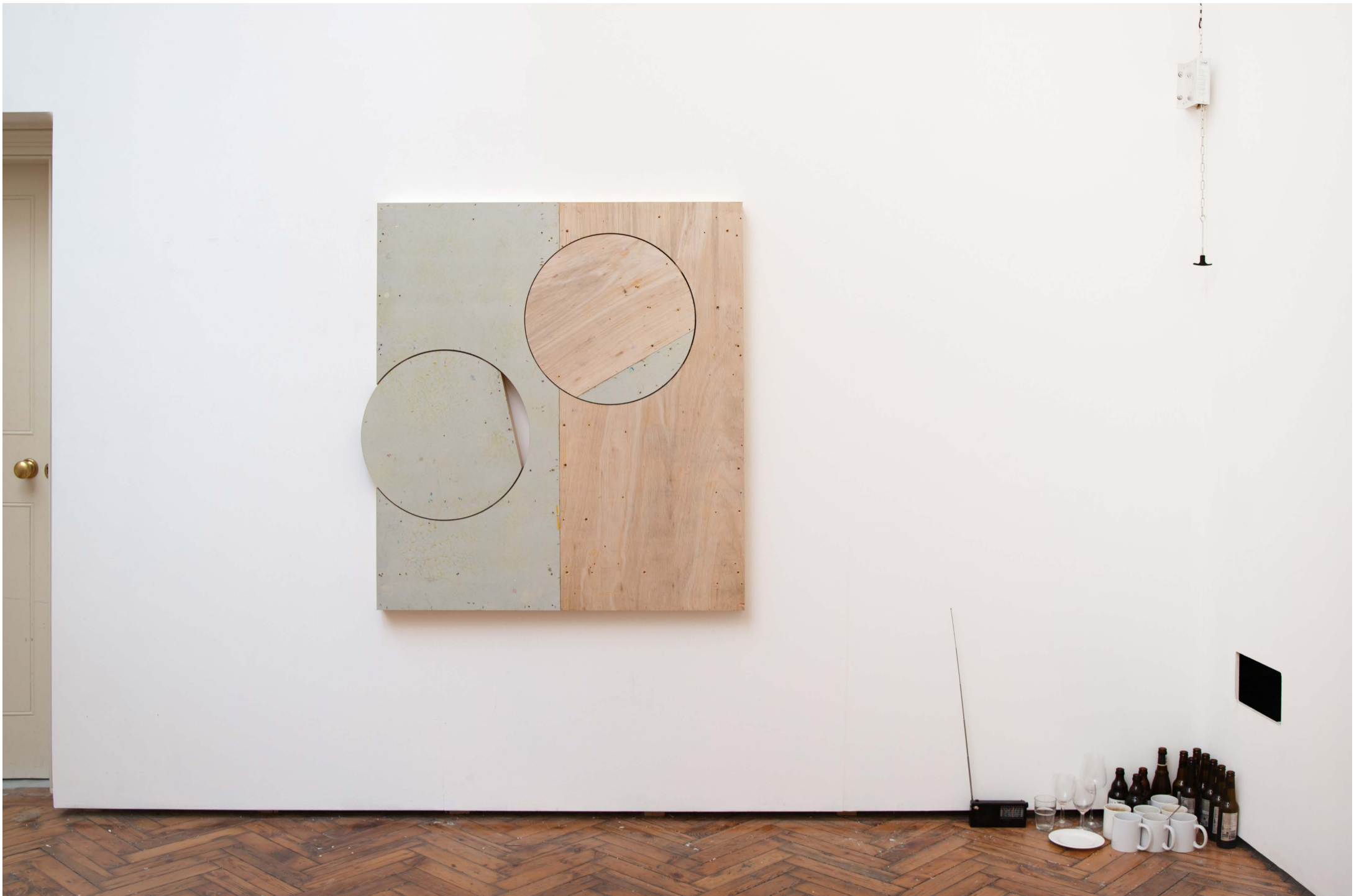
Untitled (Turned circles), Untitled (Collected cups, glasses and bottles) - 2024 - Used multiplex, empty bottles, used ceramic cups, used glasses, turned on radio