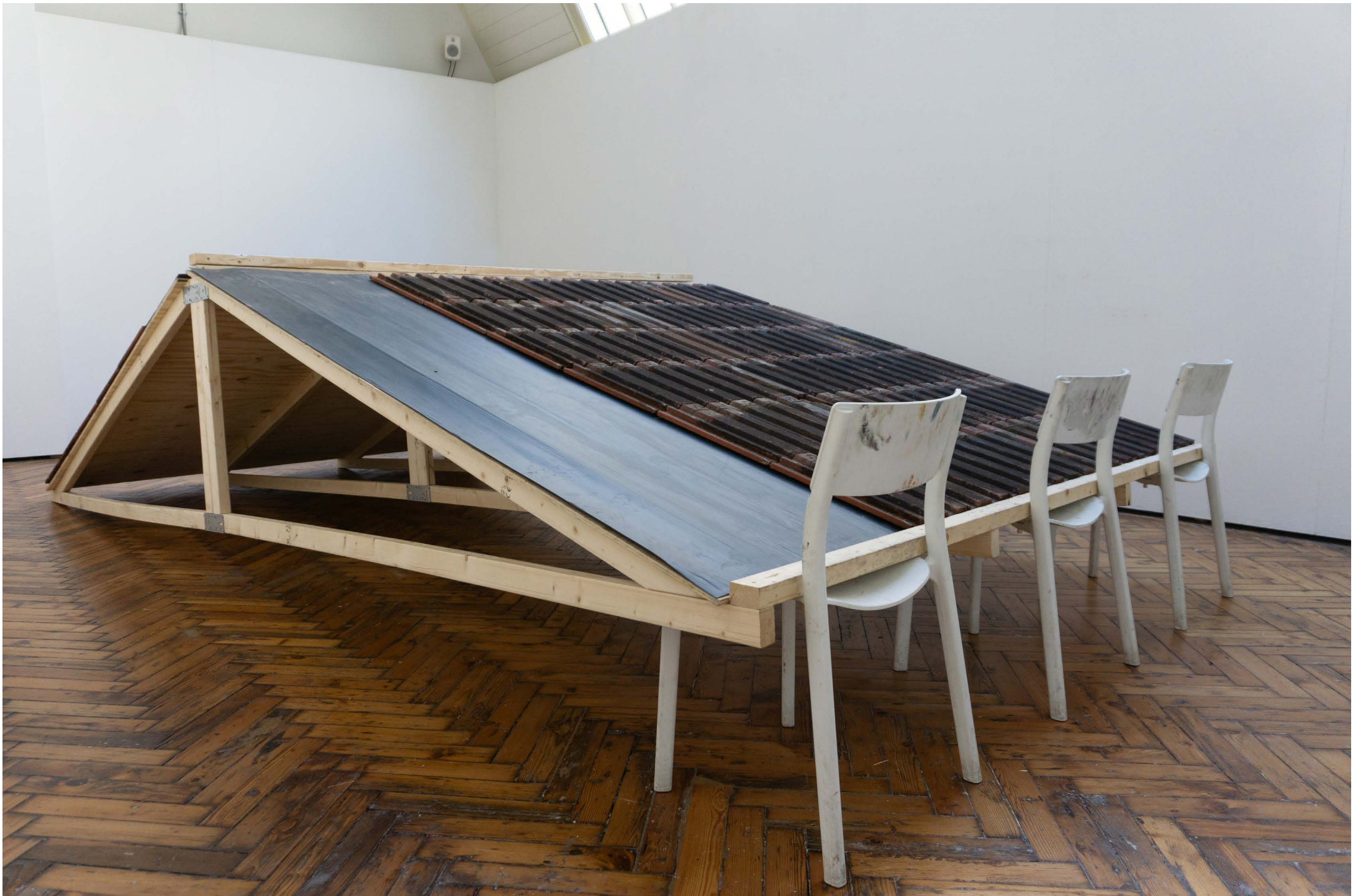
Untitled (Secundair mobile roof) - 2025 - Construction timber, plywood, wheaterd roofing tiles, chairs