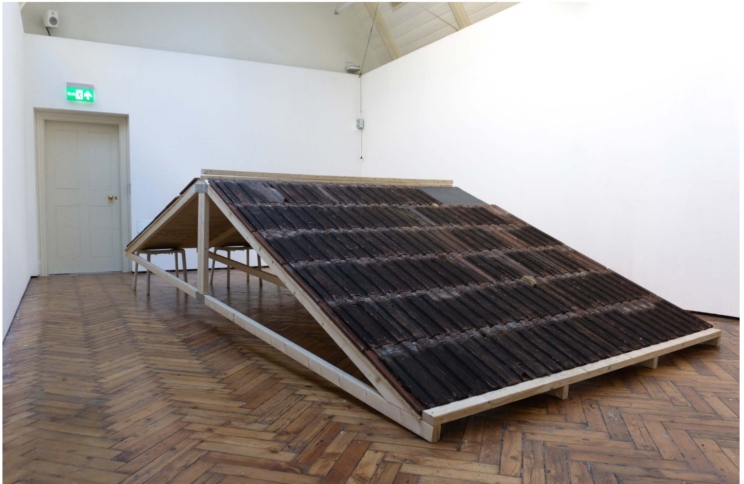
Untitled (Secundair mobile roof) - 2025 - Construction timber, plywood, wheaterd roofing tiles, chairs