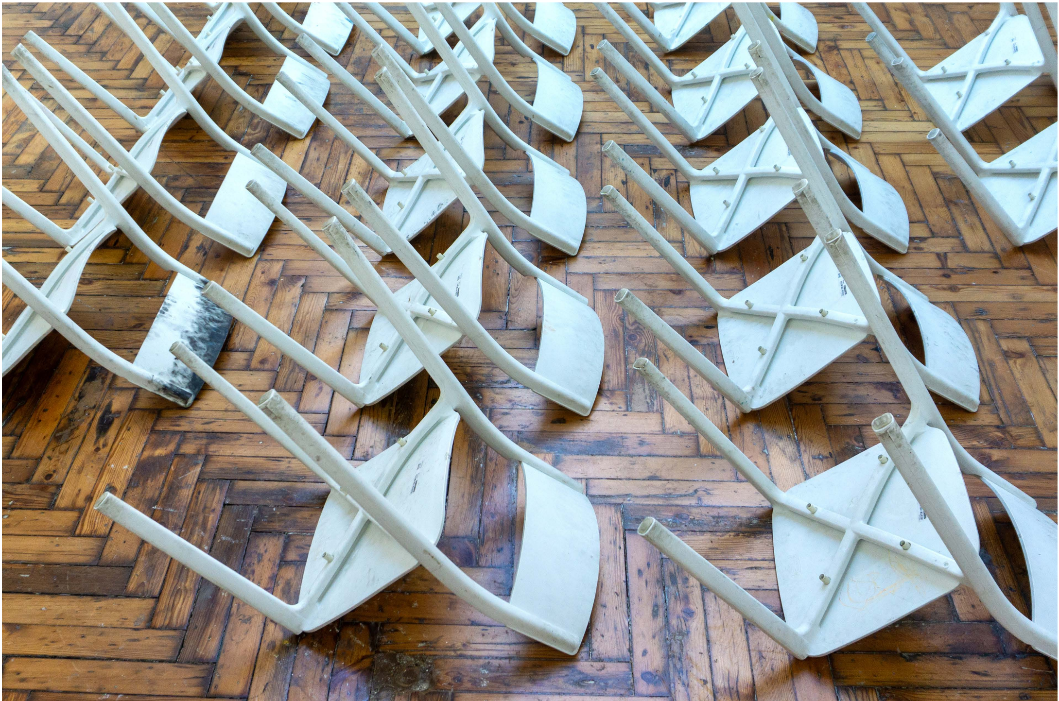
Untitled (Flipped chairs) - 2025 - Regular site used chairs