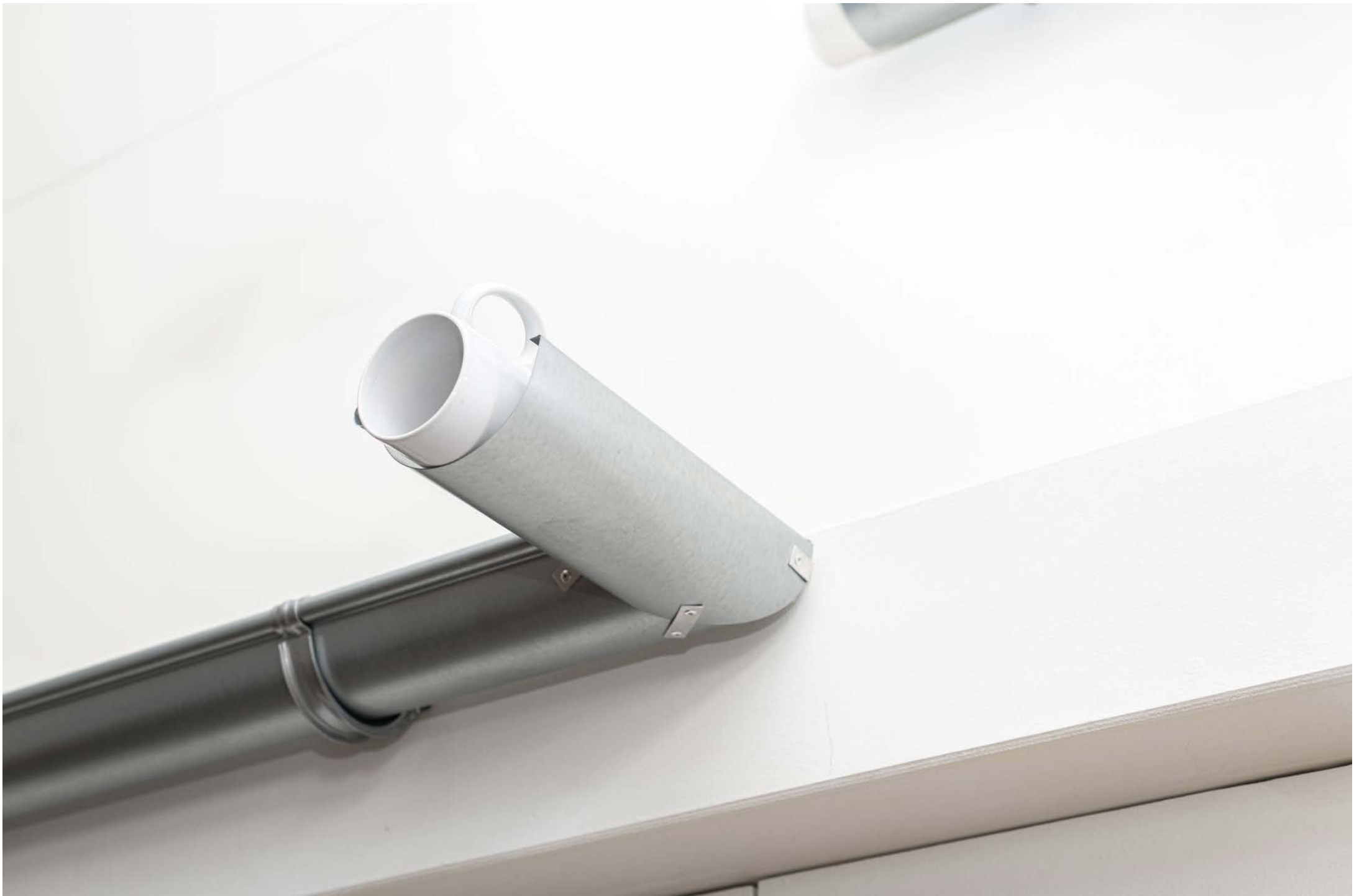
Detail: Untitled (Gutter system) 2025 - Modulair systems, galvanized steel gutters, used collected ceramic cups