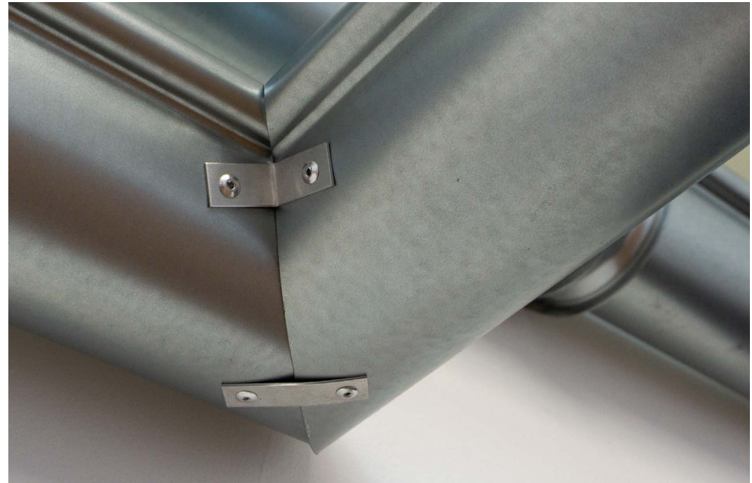
Untitled (Gutter system) 2025 - Modulair systems, galvanized steel gutters, used collected ceramic cups