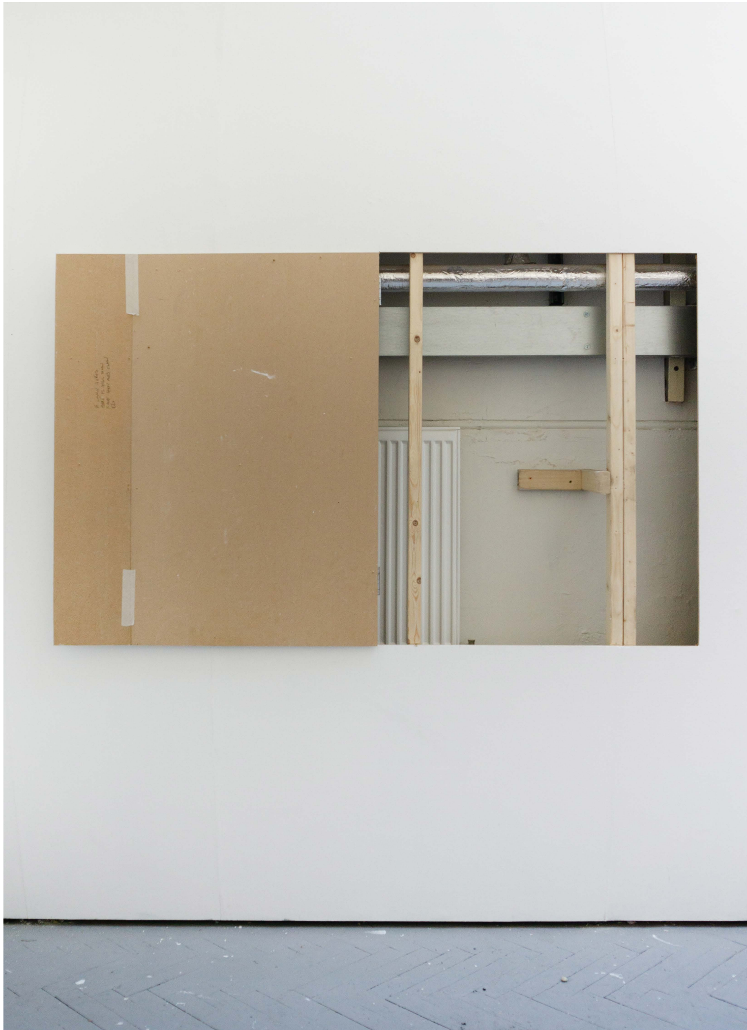
Untitled (Openend up fake wall) - 2025 - Mdf fake wall, hinges