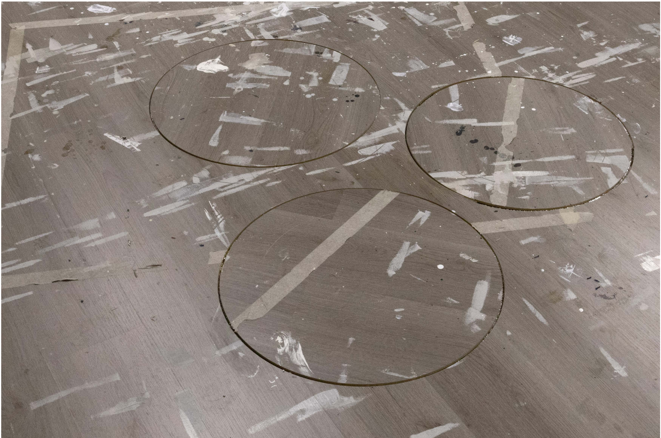
Untitled (Turned studio floor) - 2024 - Studio floor, traces