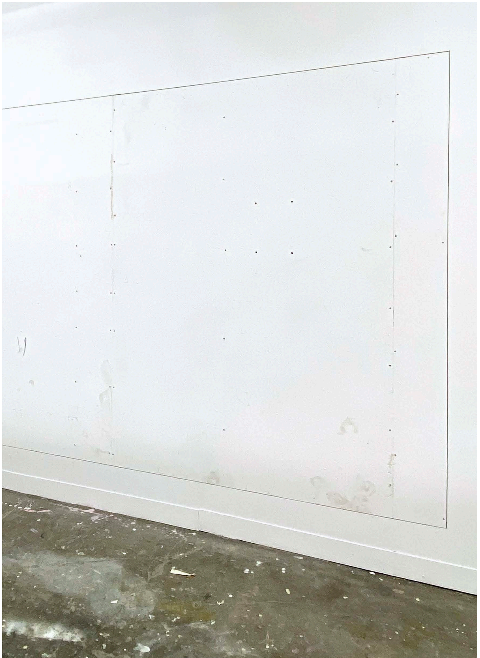
Untitled (Openend and closed wall) - 2023 - Multiplex wall, traces, screws