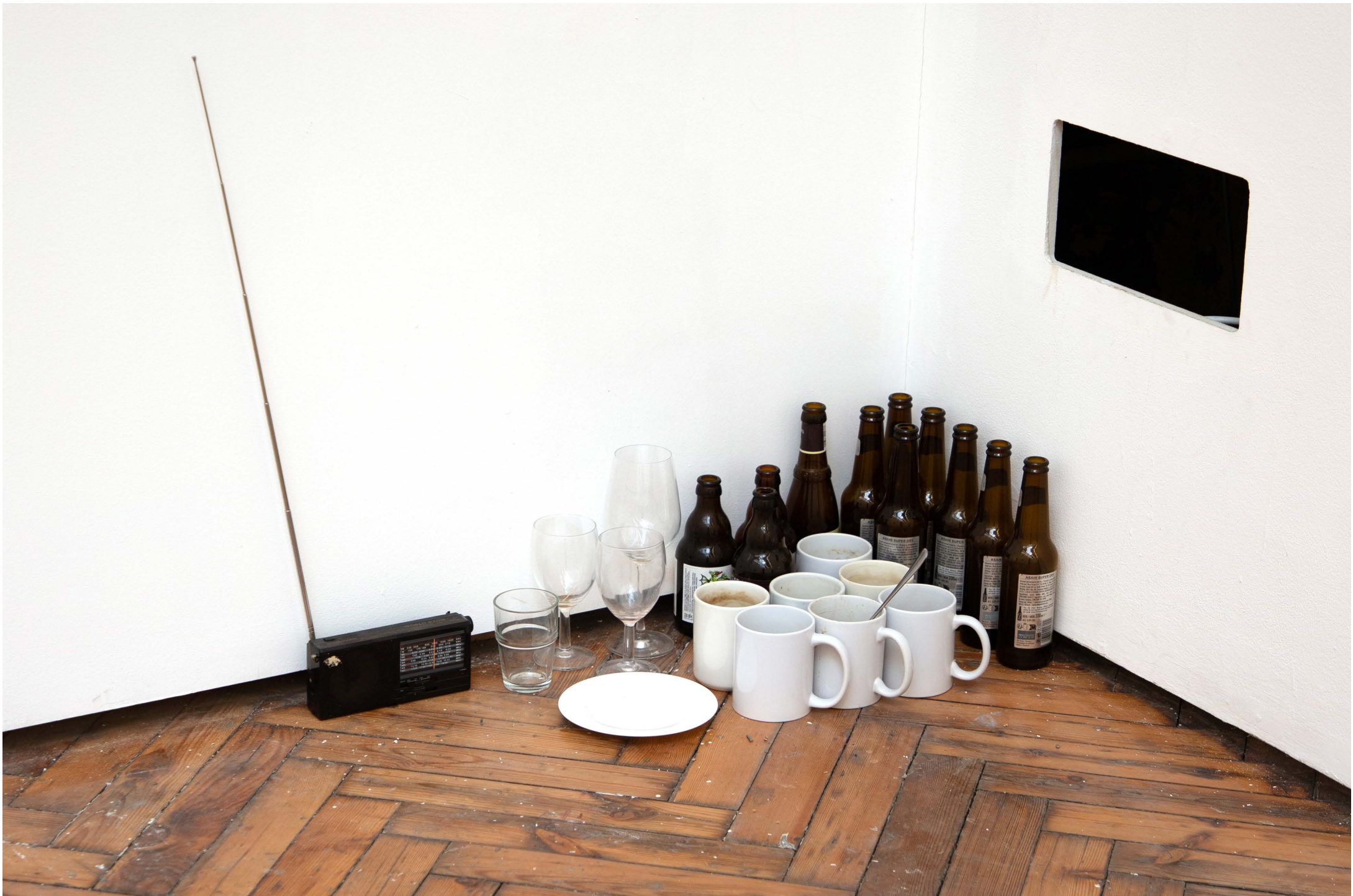
Untitled (Collected cups, glasses and bottles) - 2024 - Empty bottles, used ceramic cups, used glasses, plate, turned on radio