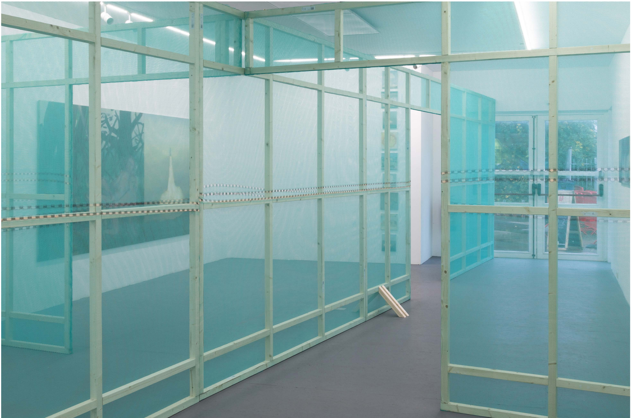
Untitled (Deviding structure) - 2023 - Construction timber, screws, scaffolind netting, painting exhibition