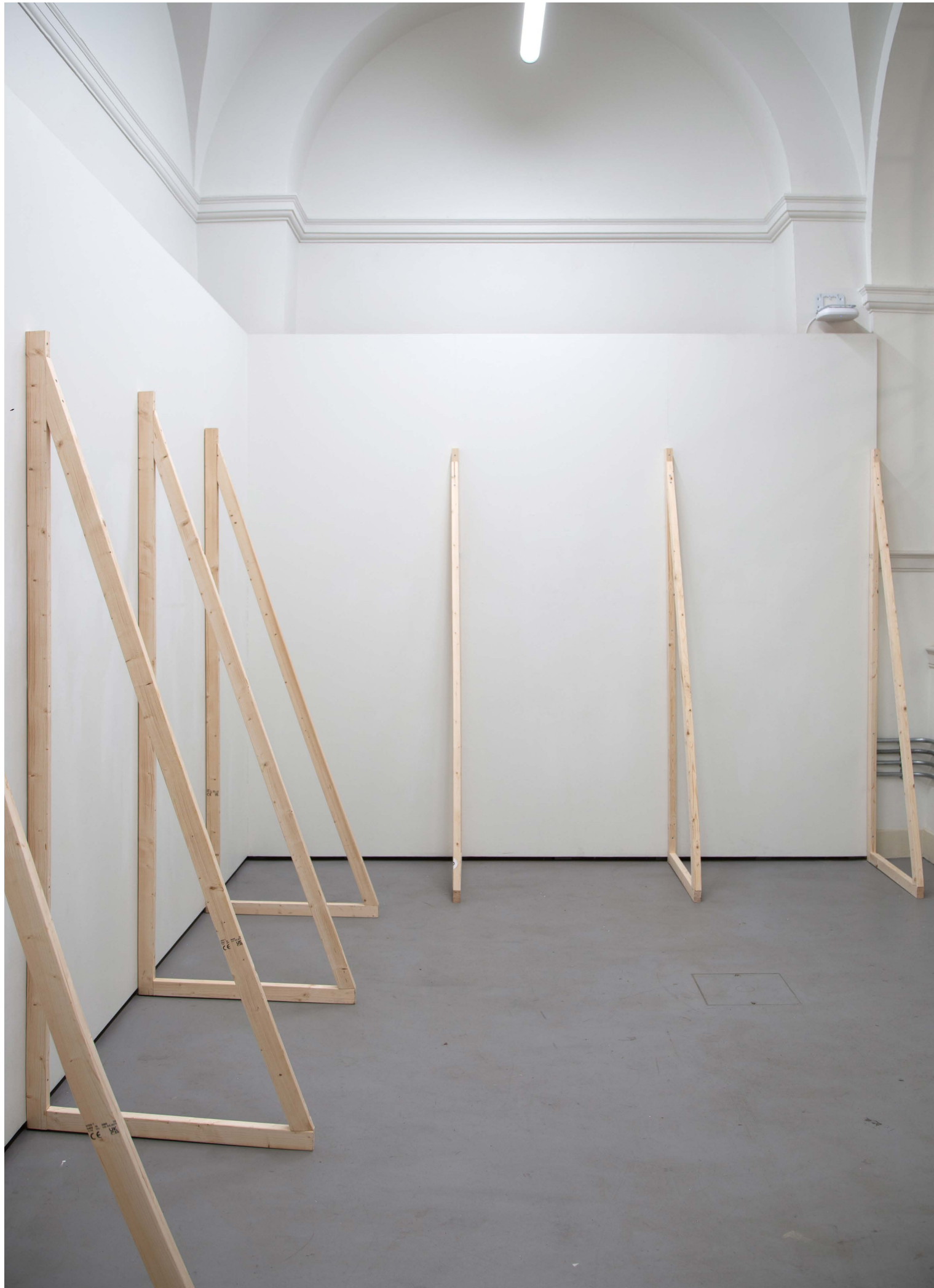
Untitled (Support structures) - 2024 - Construction timber, existing fake walls