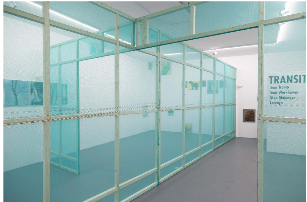
Untitled (Deviding structure) - 2023 - Construction timber, screws, scaffolind netting, painting exhibition