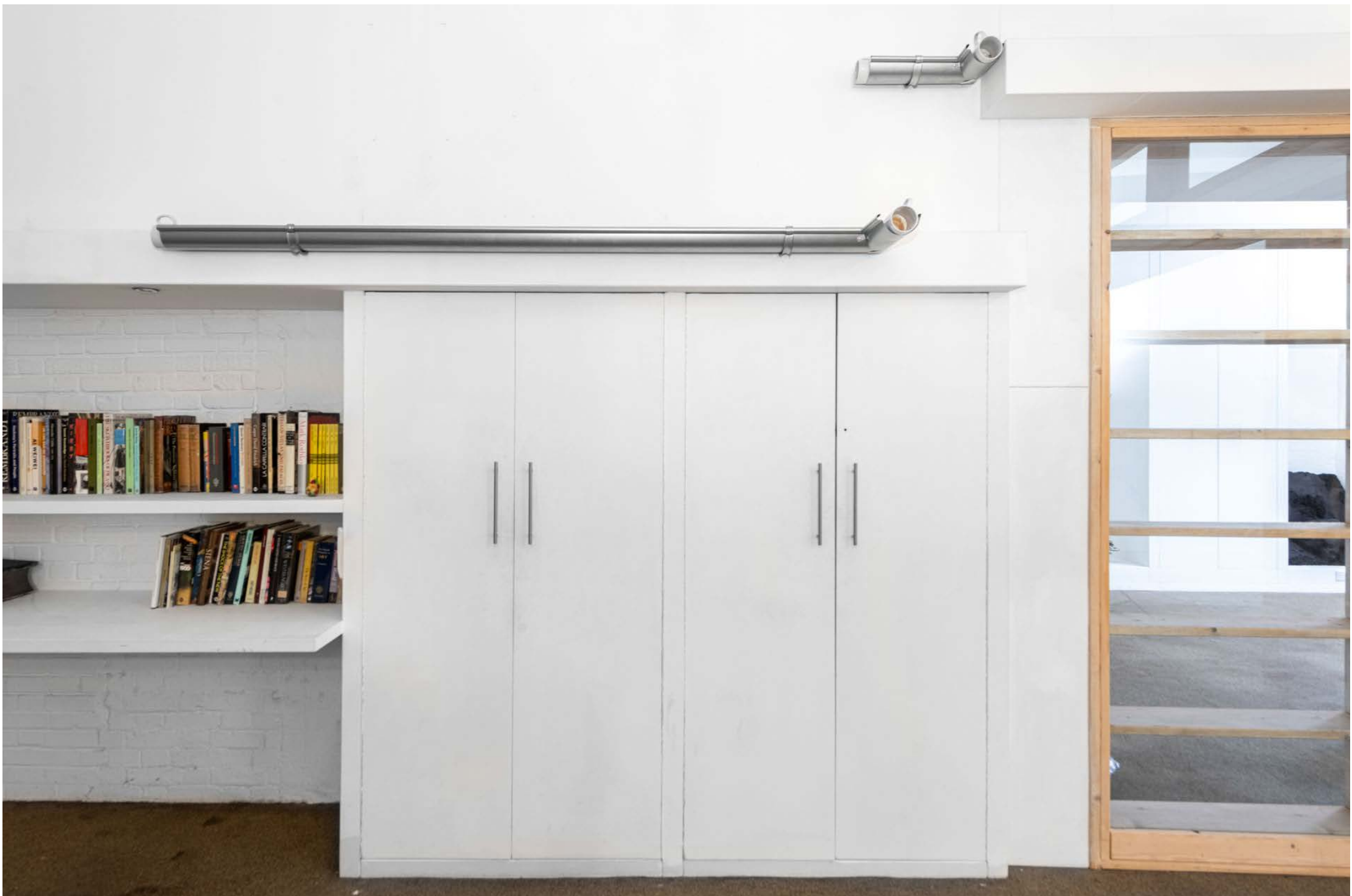
Untitled (Gutter system) 2025 - Modulair systems, galvanized steel gutters, used collected ceramic cups