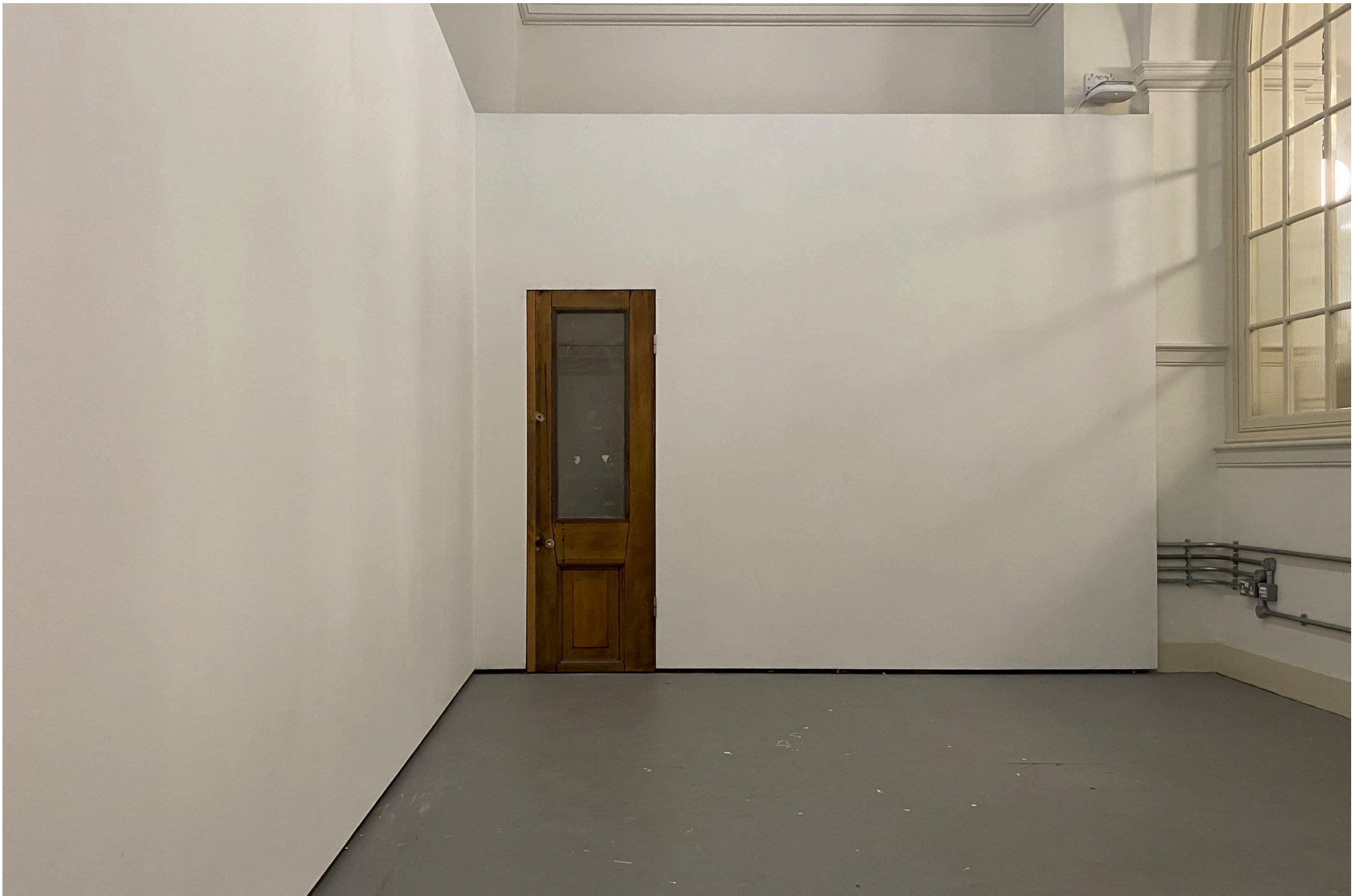
Temporary door installed (locked) for 72 hours - (2025)