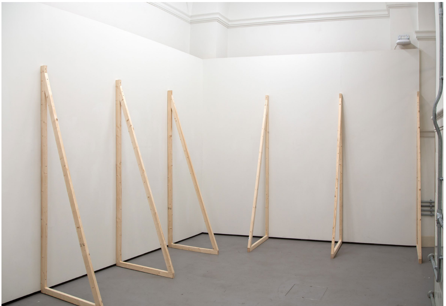
Untitled (Support structures) - Walls being supported from the inside - 2024 - Construction timber, existing fake walls