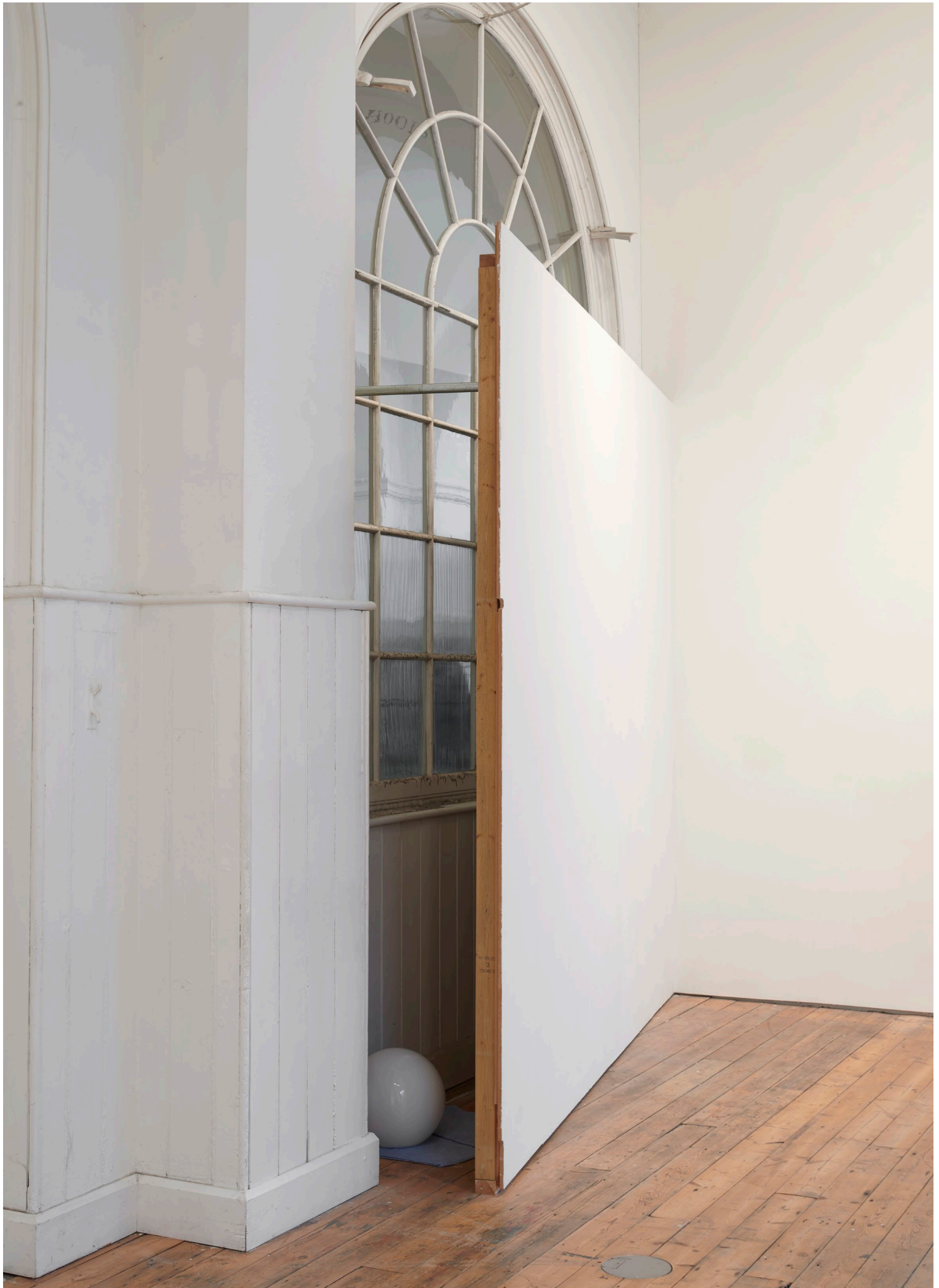
A wall left ajar, housing its primary light source // 03.03.26-24.04.26 // Globe no.7 moved, no.1, no.2, no.3, no.4, no.5, no.6, no.8, no.9, no.10, no.11, no.12, no.13, no.14, no.15, no.16 untouched // wool jumper // light bulb // globe no.7