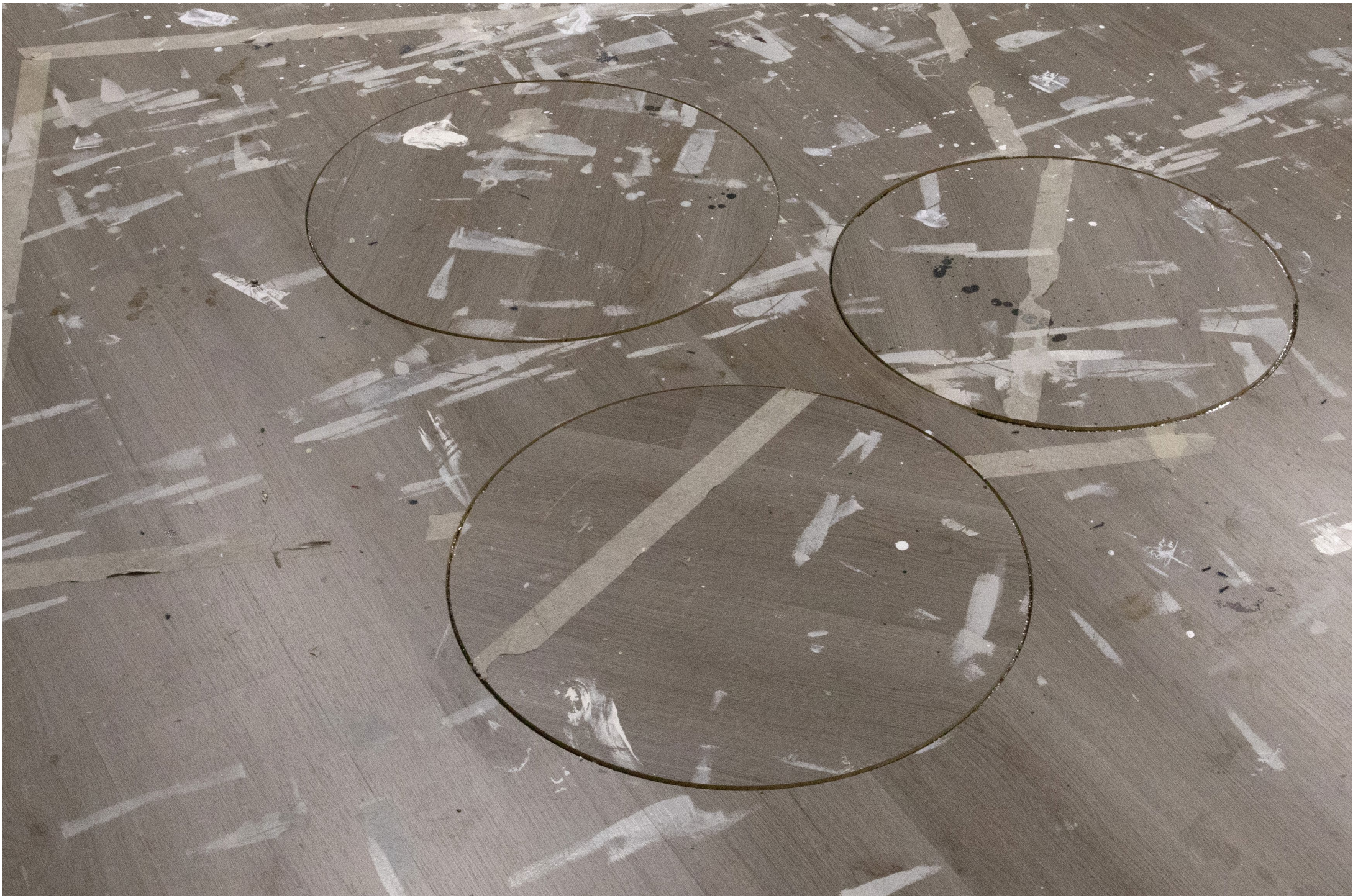
Untitled (Rupture in studio floor) - 2024 - Studio floor, traces