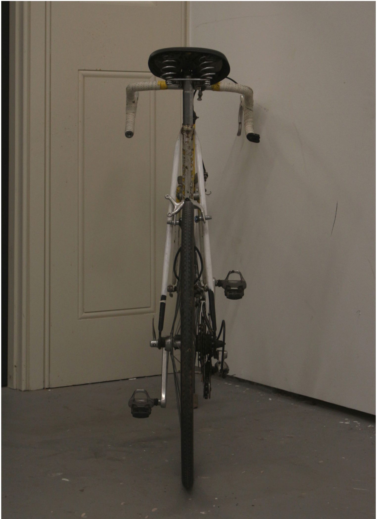
Bike pointing north - (2026)