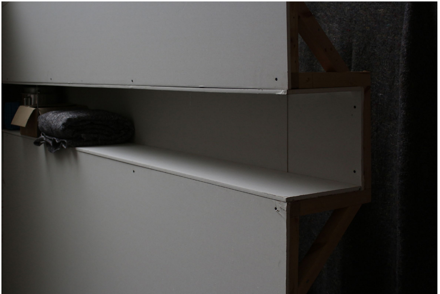
Studio sketch - Secundair architectural feature holding a combination of personal belongings and other stuff (2026)