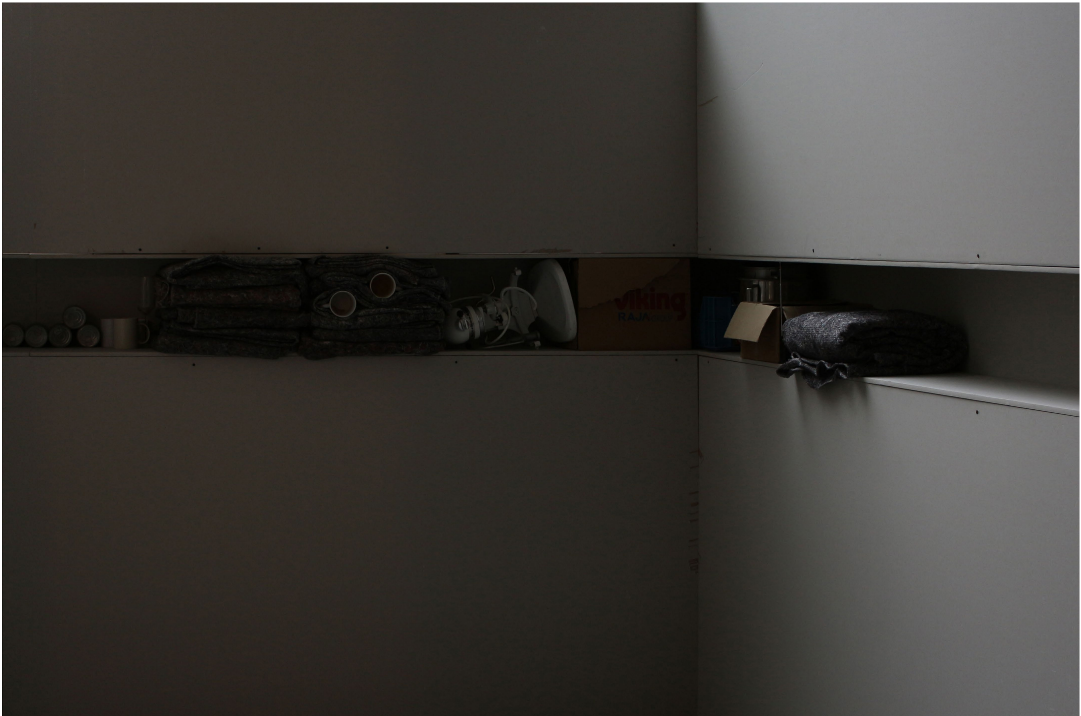
Studio sketch - Secundair architectural feature holding a combination of personal belongings and other stuff (2026)