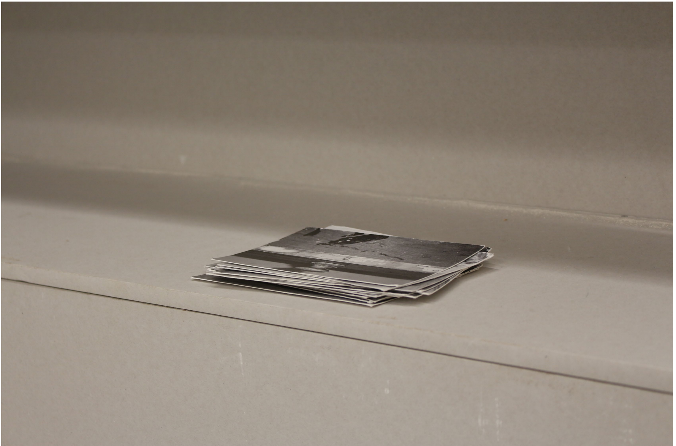
130 pre-adressed postcards sent, 11,5% returned (2025 - ongoing) Unfinished