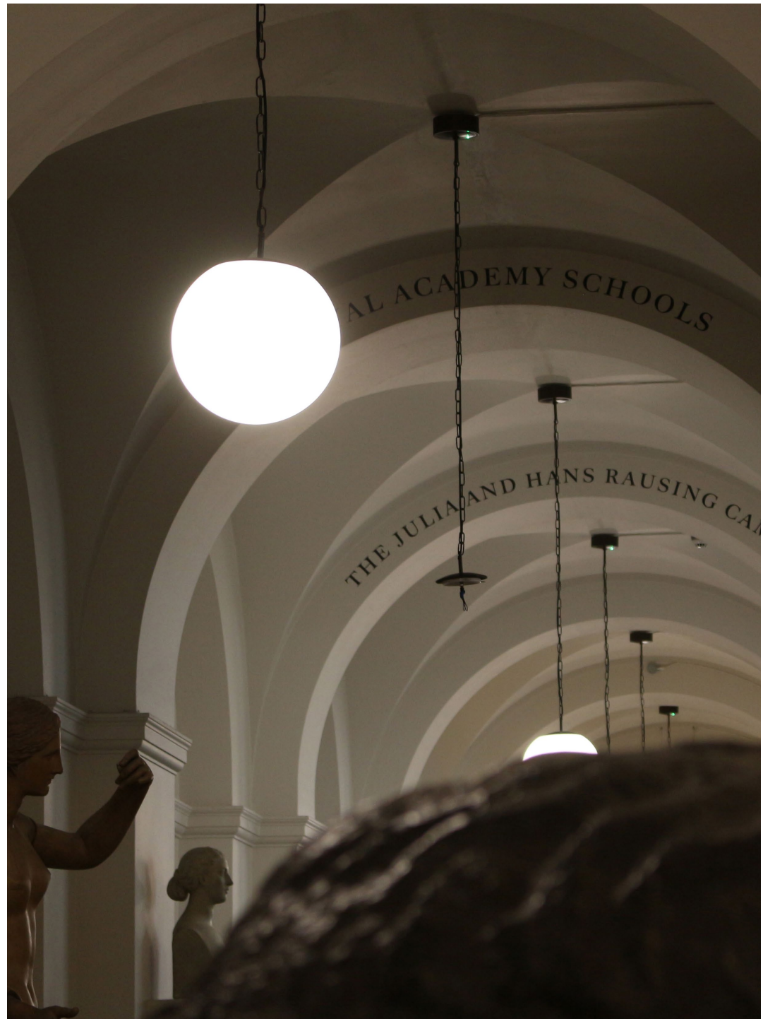
A wall left ajar, housing its primary light source // 03.03.26-24.04.26 // Globe no.7 moved, no.1, no.2, no.3, no.4, no.5, no.6, no.8, no.9, no.10, no.11, no.12, no.13, no.14, no.15, no.16 untouched // wool jumper // light bulb // globe no.7