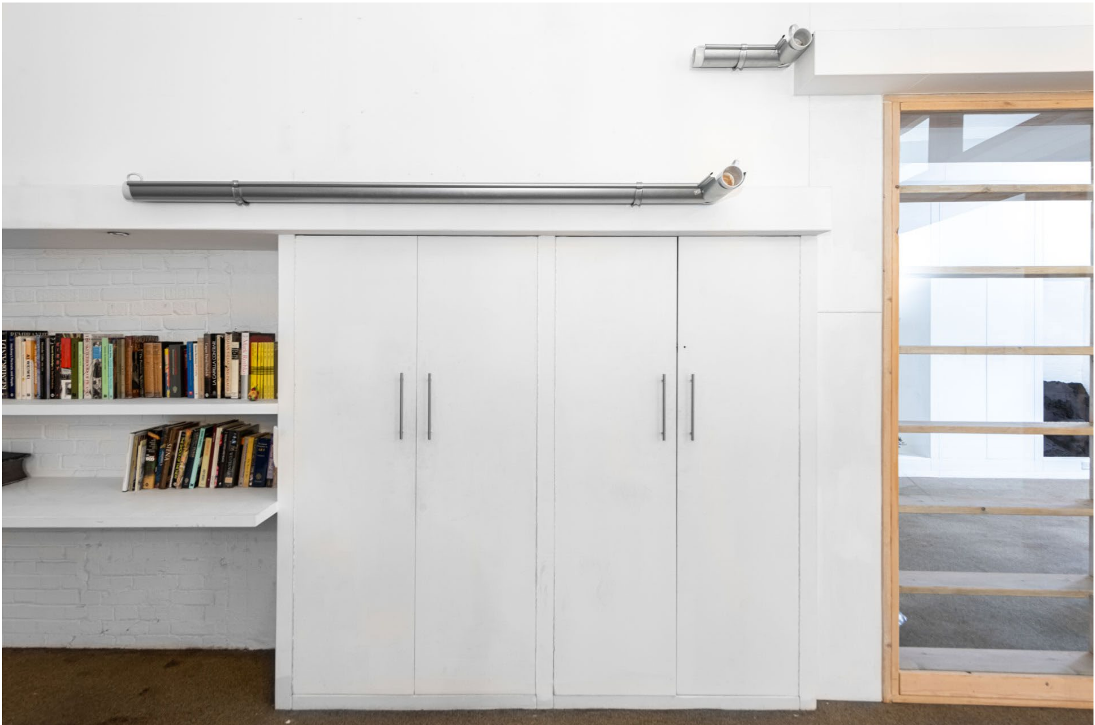
Untitled (Gutter system) 2025 - Modulair systems, galvanized steel gutters, used collected ceramic cups