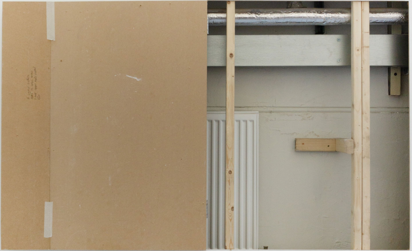
Untitled (Openend up fake wall, exposing radiator and builders notes) - 2025 - Mdf fake wall, hinges