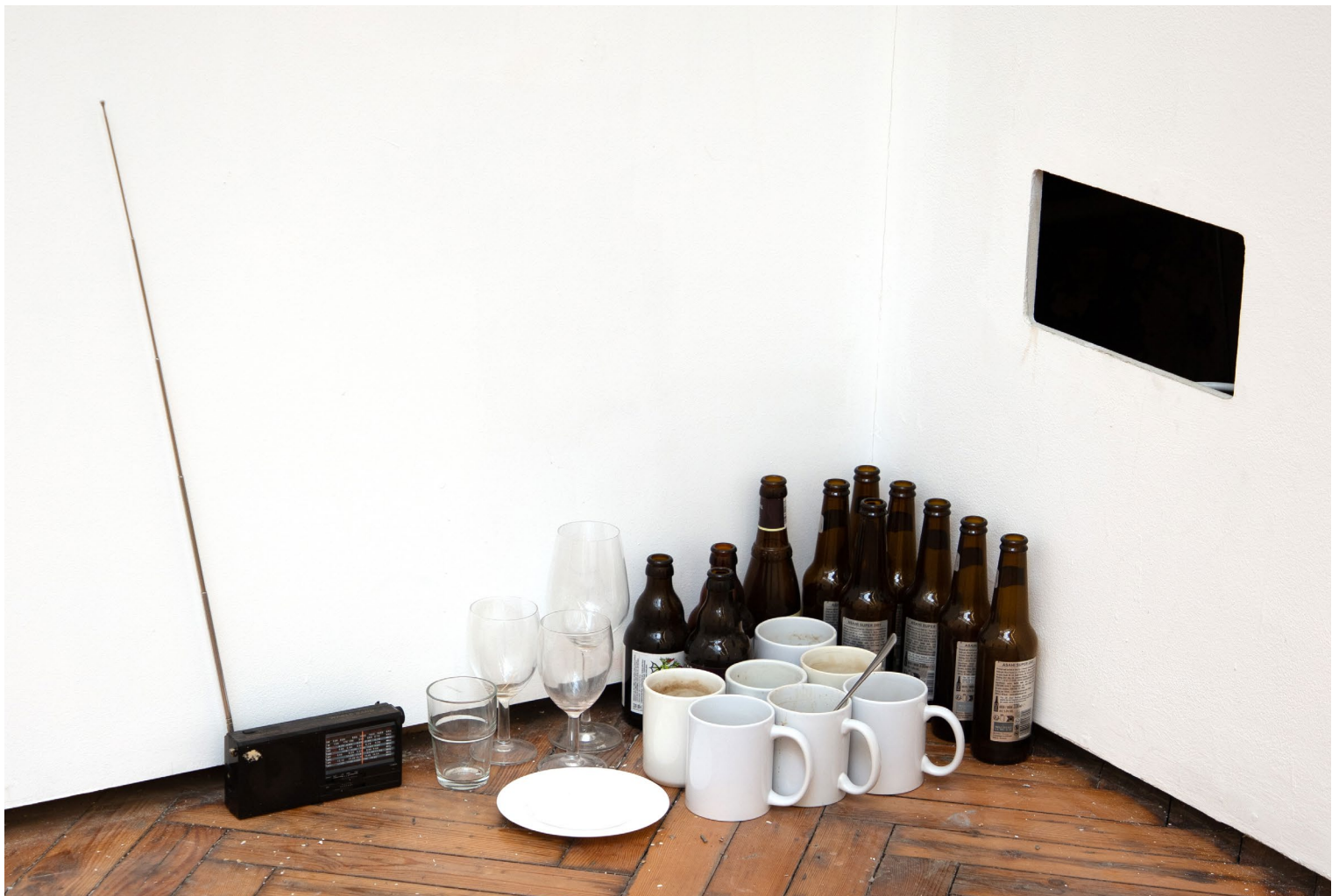
Collected cups, glasses and bottles accompanied by turned-on radio - (2024)