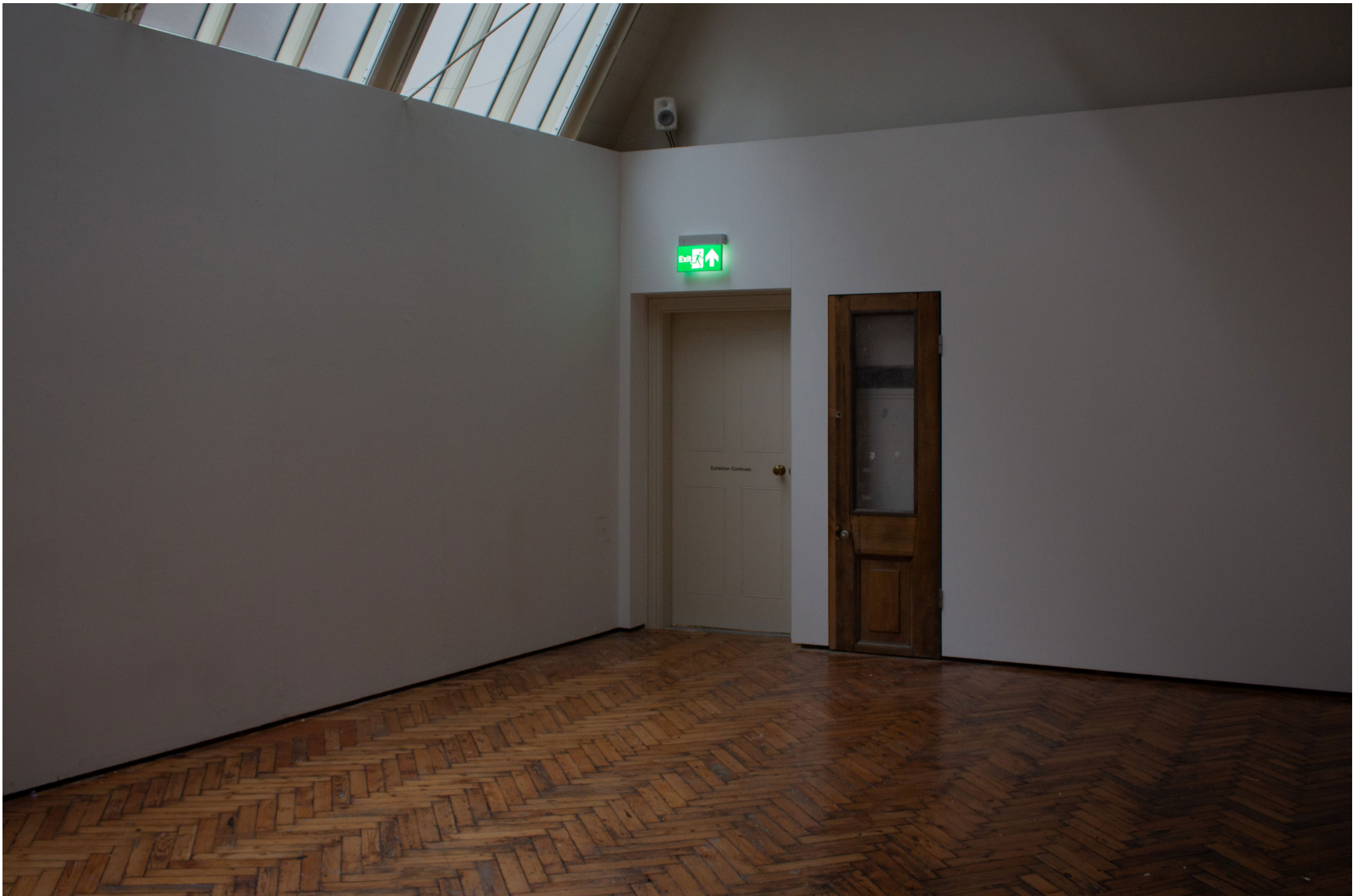
Temporary door installed (locked) for 72 hours - (2026)