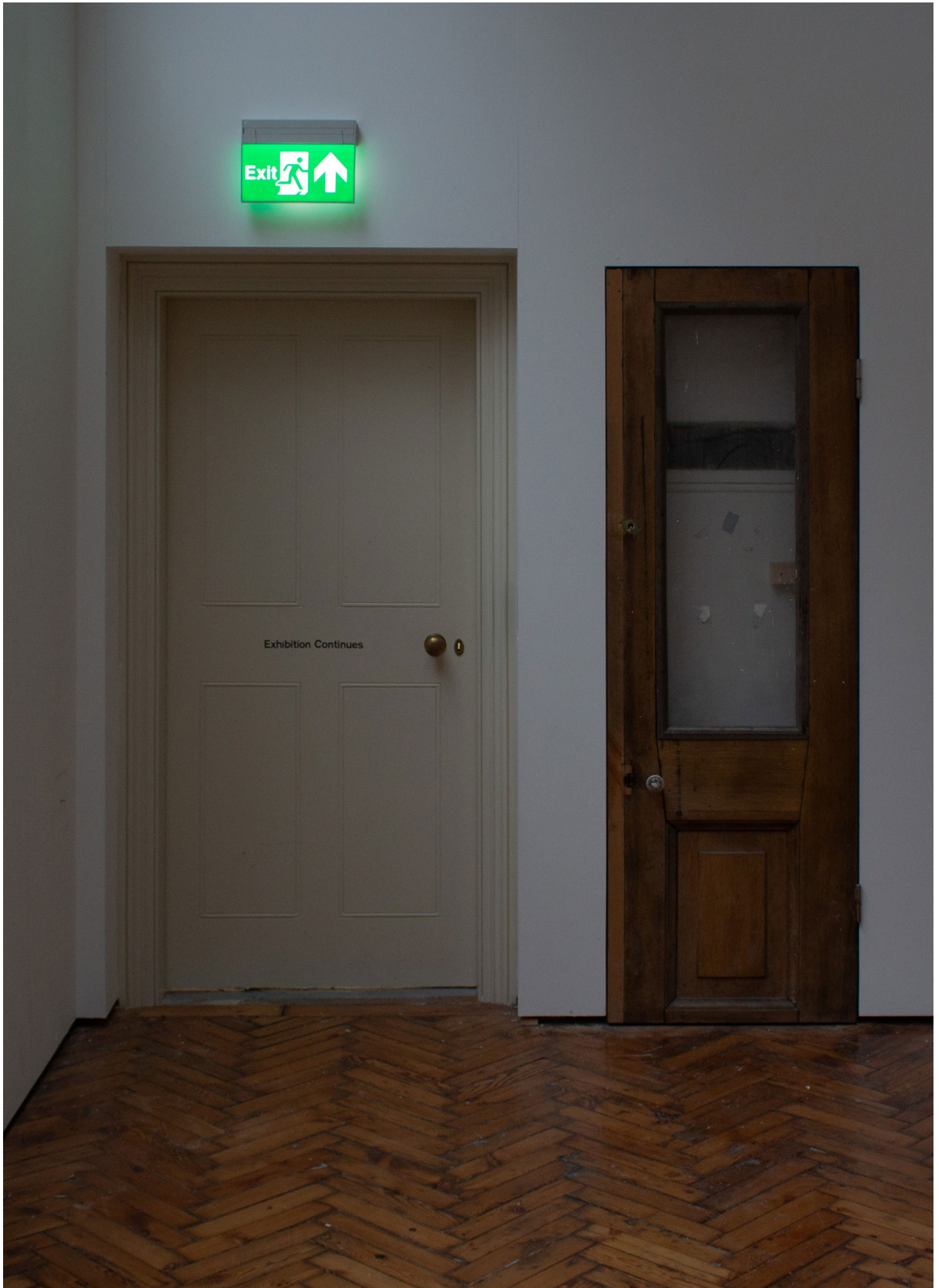
Temporary door installed (locked) for 72 hours - (2026)