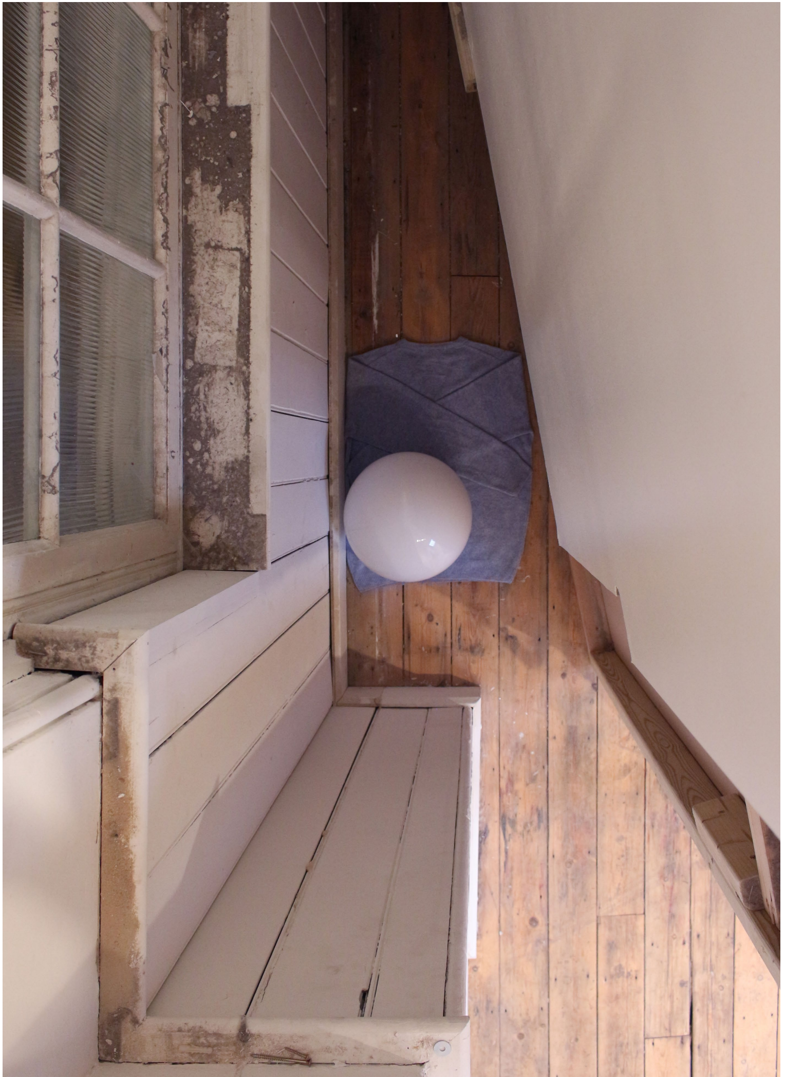
A wall left ajar, housing its primary light source // 03.03.26-24.04.26 // Globe no.7 moved, no.1, no.2, no.3, no.4, no.5, no.6, no.8, no.9, no.10, no.11, no.12, no.13, no.14, no.15, no.16 untouched // wool jumper // light bulb // globe no.7